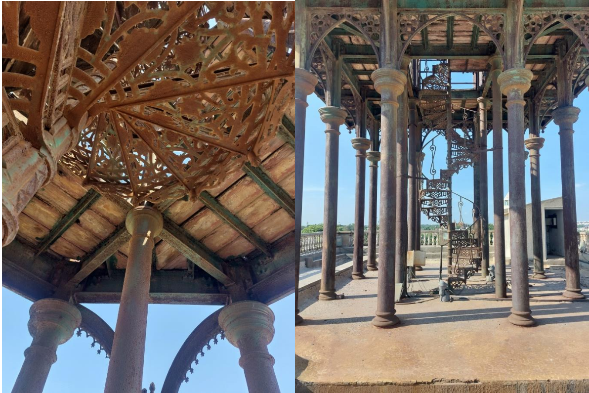
Figure 5: Iron elements exhibit rusting and corrosion