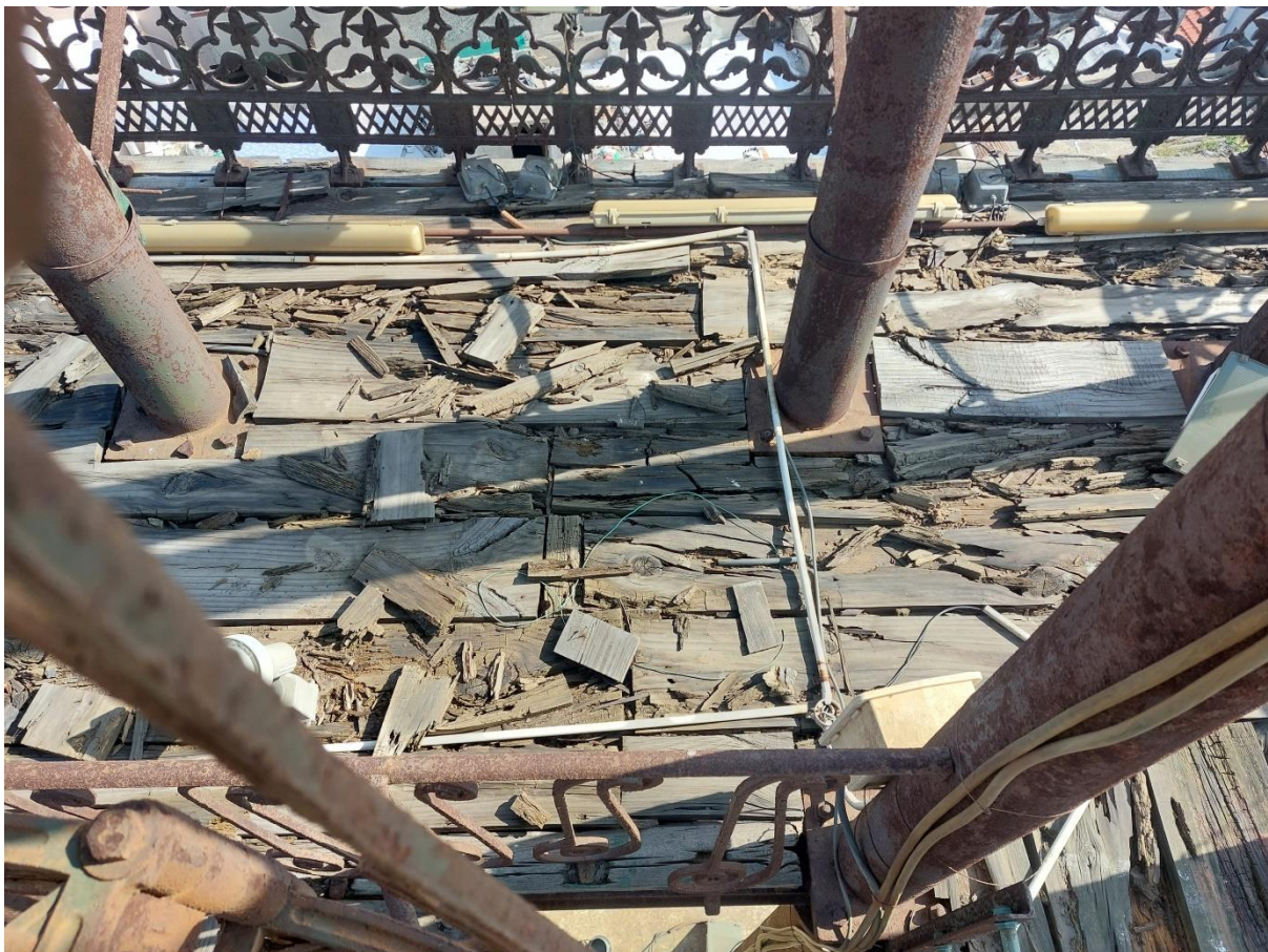
Figure 4: Decay of wooden elements