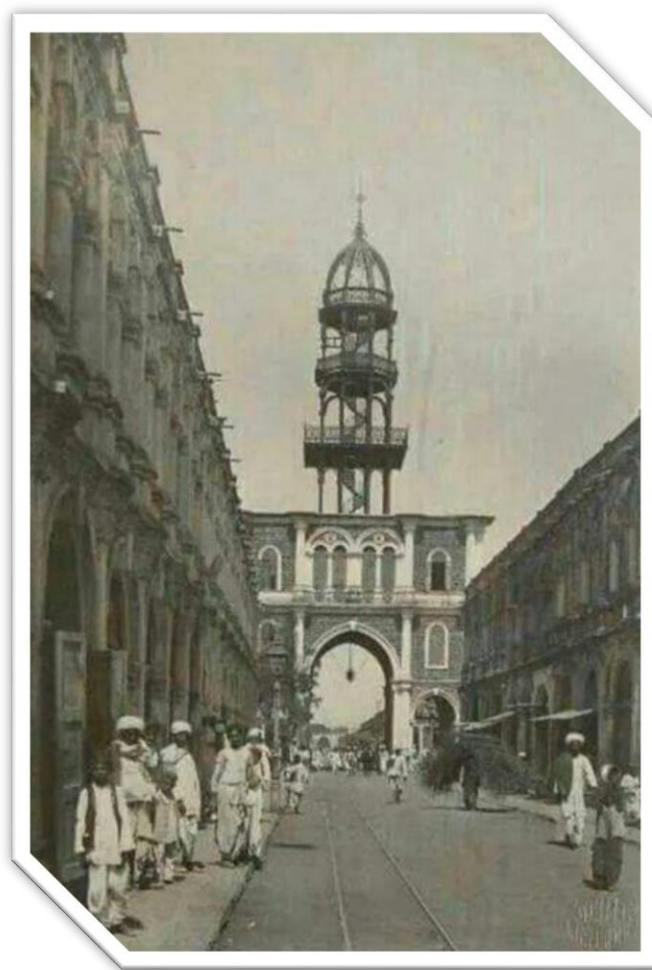
Figure 1: Historic image of the clock tower building

The Green Tower of Morbi is an iconic structure known for its striking green appearance and its blend of architectural influences. Built in 1888 and inspired by the Eiffel Tower of Paris, the tower was envisioned by Maharaja Lakhdhirji, who aimed to create a landmark that would reflect both grandeur and modernity for the town.